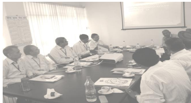
Presentation by IFAs under WC in progress

The IFAs made presentations about the functioning of their offices and the progress against Performance Targets given to them. The issues pertaining to Work proposals after delegating of powers to STS/JTS level IFAs were also discussed.