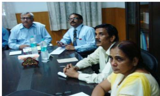
Presentation on IFA(CC) functioning in progress