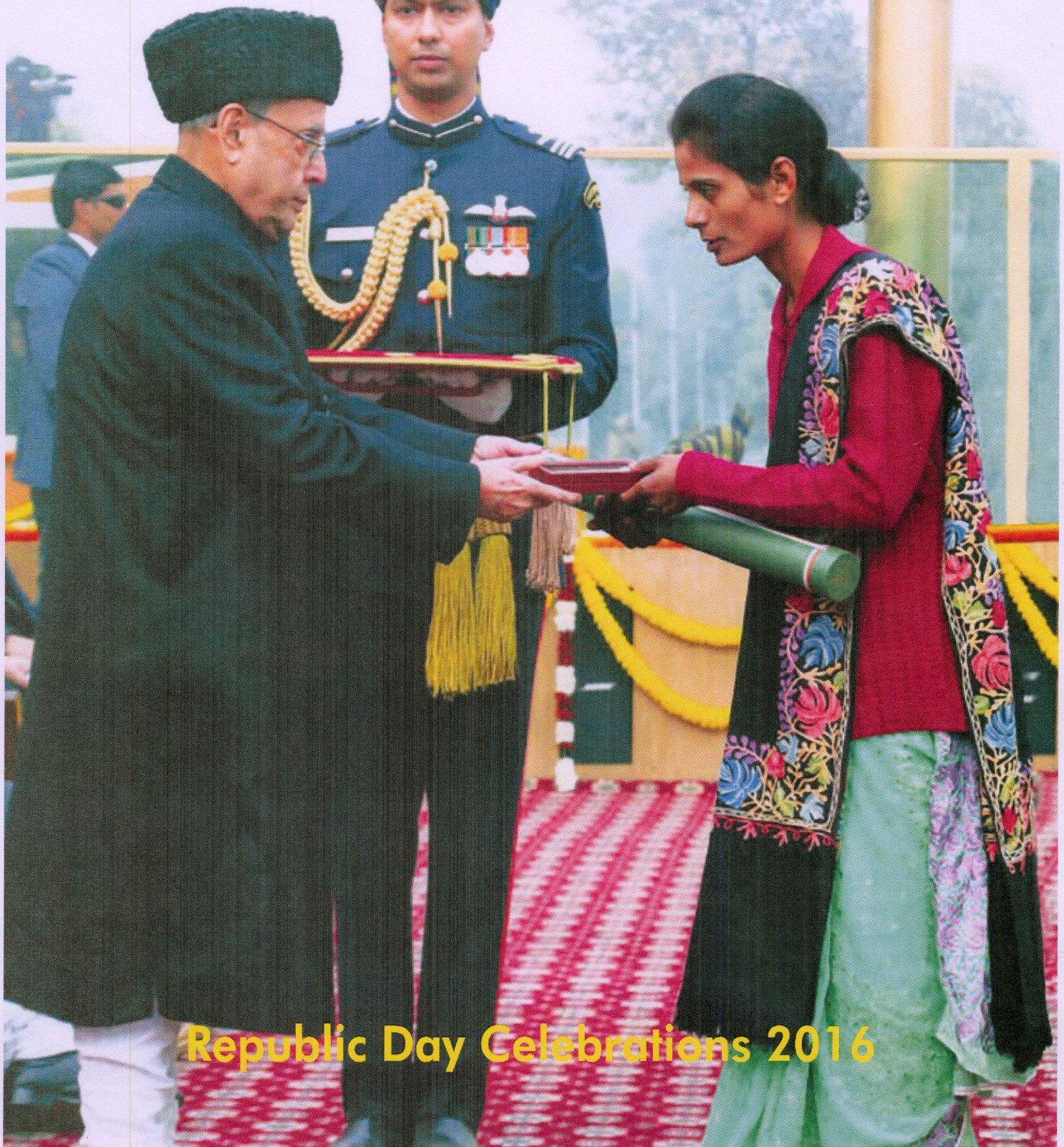
Republic Day Celebrations 2016