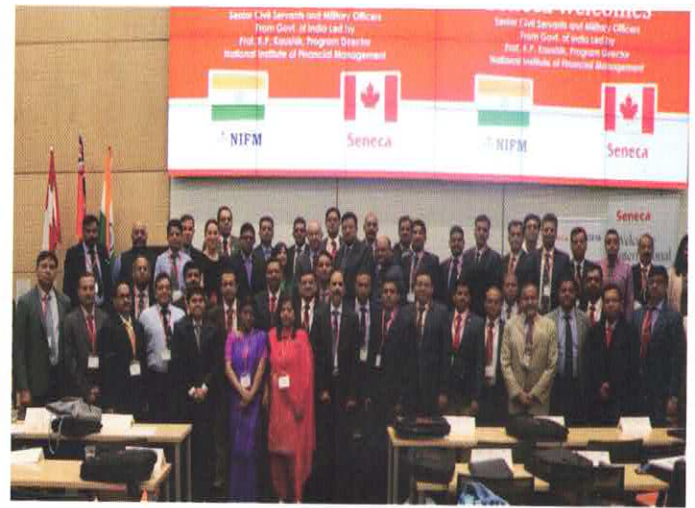
Participants of PGDM (Financial Management) 2017-19 Batch and 2018-20 Batch visited two weeks International Attachment at Seneca College, Canada