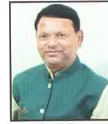
Shri Pankaj Chaudhary Minister of State for Finance Vice President - AJNIFM Society