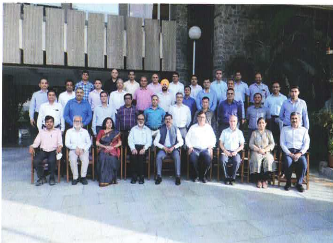
Group Photo of PGDM(FM) 2021-23 Batch

AJNIFM faculty guides the participants in research, analysis, preparation and completion of the project. The participants are expected to remain in regular touch with their faculty guides for timely completion of the project work. The project work is required to be completed and submitted before the notified due date.