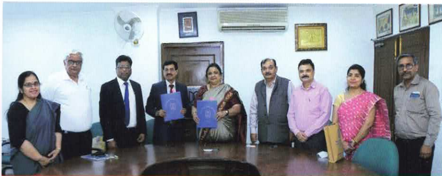
Signing of MoU between AJNIFM and JNU on 15th March 2022