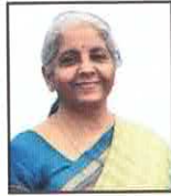
Smt. Nirmala Sitharaman Union Finance Minister & Corporate Affairs President - AJNIFM Society