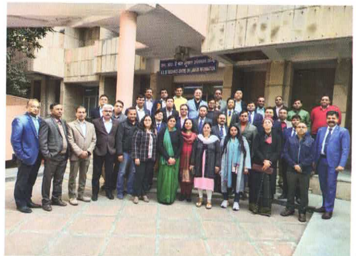
Participants of MBA (Financial Management) 2022-24 Batch - one day training at V.V. Giri National Labour Institute, Noida