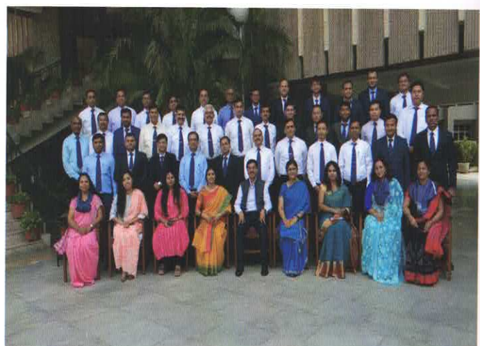
Group Photo of MBA(FM) 2022-24 Batch