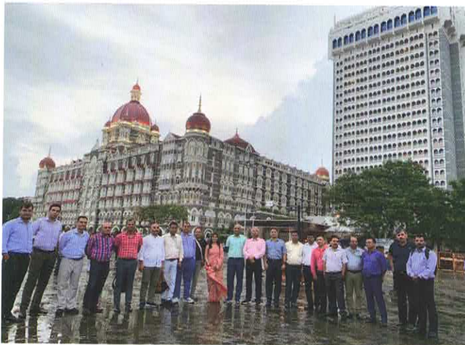
Participants of PGDM (Financial Management) 2021-23 Batch - one week domestic visit at Mumbai