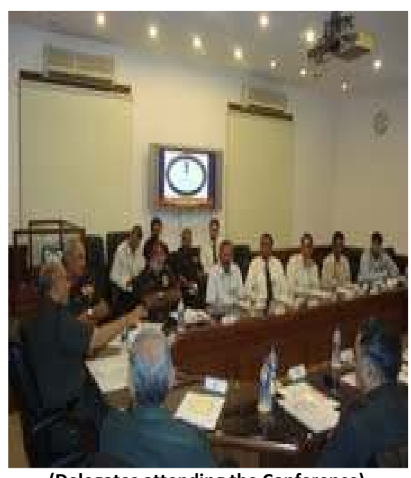
(Delegates attending the Conference)

Welcoming the participants the VCOAS expressed satisfaction over evolution of the forum as an interface between CFAs and IFAs. He expressed confidence that such interaction between CFAs and IFAs is an effective way to ensure good communication between SHQ and the Finance Wing.