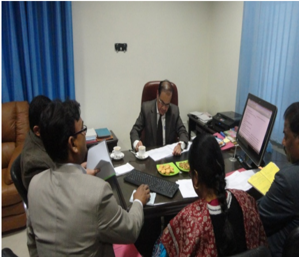
(Inspection Review of IFA (CAC) in progress)